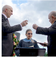
Weddings & Celebrations