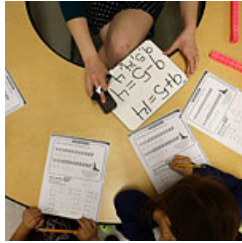
Editorial Observer: A Complex Duet