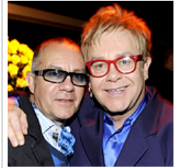
Still Making Music Together, Far Apart