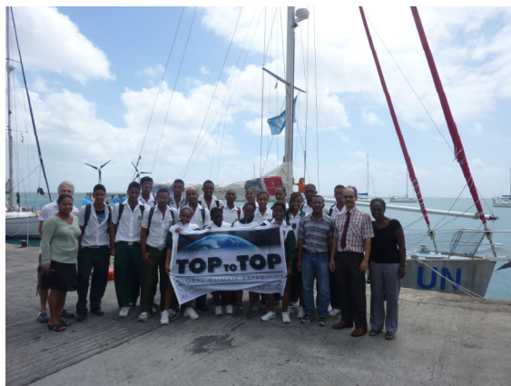
Students from College de Port Mathurin in Rodrigues Visit PACHAMAMA after TOPtoTOP presentation

The Swiss family Schwörer are the core expedition team members. The 4 children are born on the expedition. Alegra the youngest crew on board is only 5 months old. Volunteers are joining the family. They are engaged in educational activities with schools and universities, inspiring the use of clean energy. So far they have sailed 48'000 nautical miles in their expedition vessel, climbed over 400'000 vertical meters, cycled over 18'000 kilometres and visited over 50'000 students!